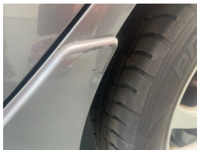
Left sill - Scratch