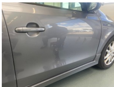
Front left door - Restyle dent