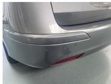
Rear bumper - Scratch