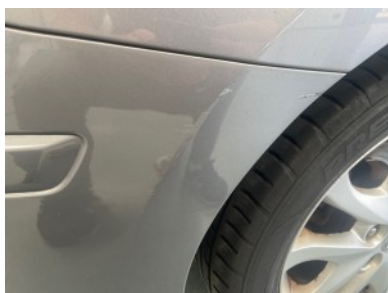
Rear bumper - Scratch