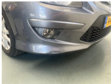
Front bumper - Scratch