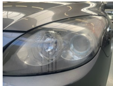
Left headlight - Vocht