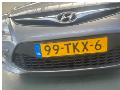
Front bumper - Scratch