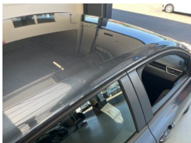
Right B- column - Restyle dent