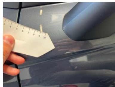
Front left door - Rust formation