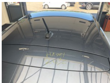
Roof - Hail damage