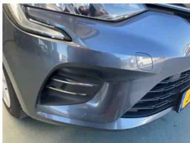
Front bumper - Scratch