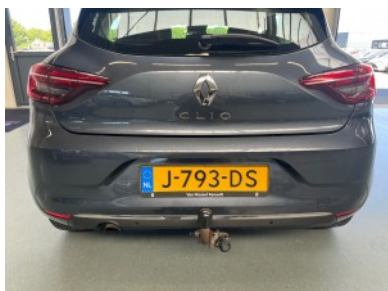
Rear bumper - Scratch