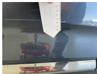
Rear right door - Scratch