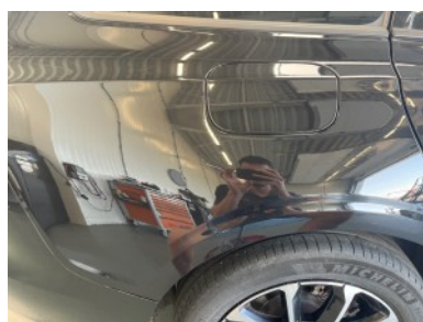
Rear right screen - Scratch