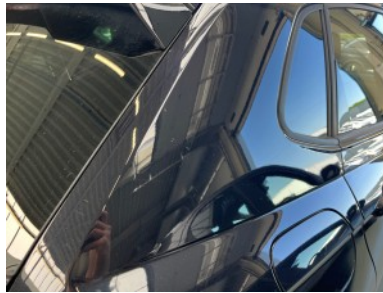
Rear right screen - Bird droppings