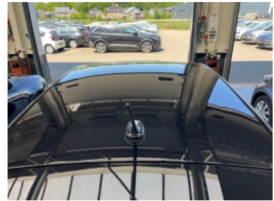
Roof - Dent