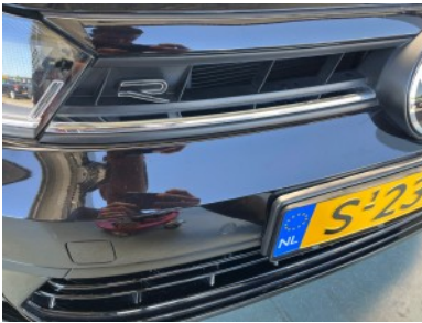
Front bumper - Break