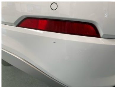
Rear bumper - Scratch