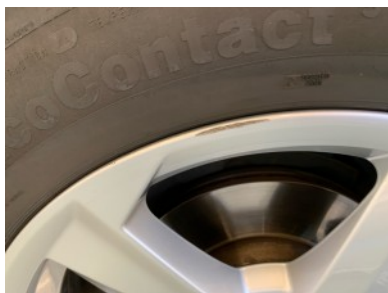
Front right rim - Scratch