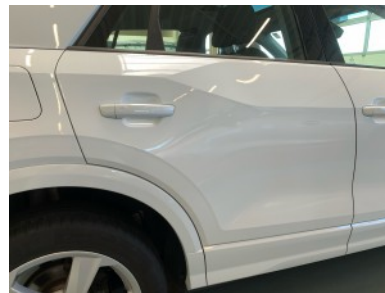
Rear right door - Paint repair