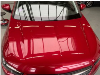
Bonnet - Bird droppings