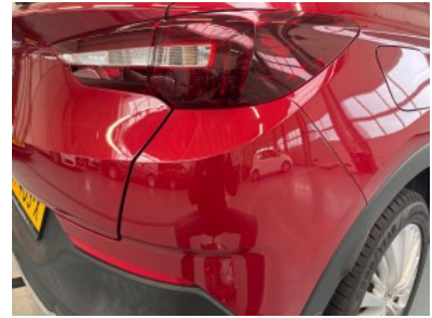
Rear bumper - Paint repair