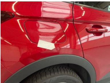
Rear right screen - Restyle dent