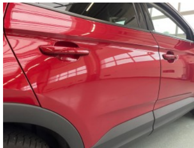
Rear right door - Paint repair