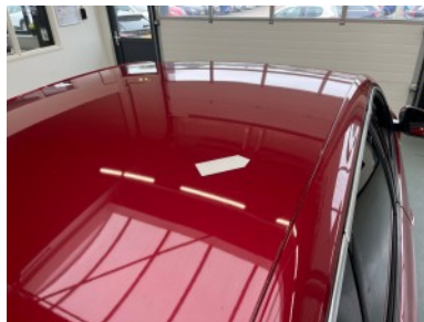
Roof - Restyle dent