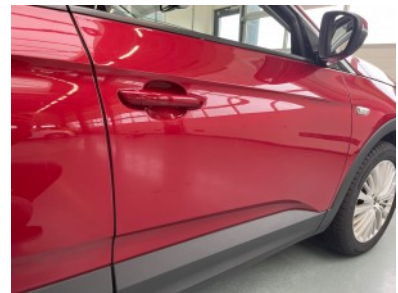
Front left door - Paint repair