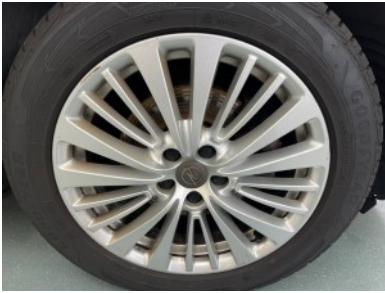
Front right rim - Scratch