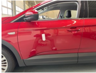
Front left door - Dent