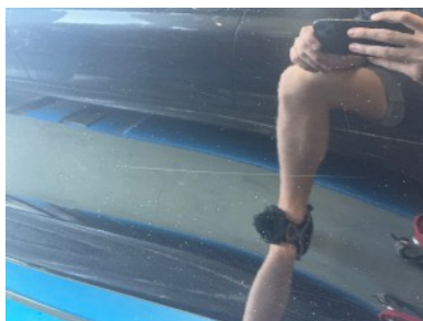
Rear left door - Scratch