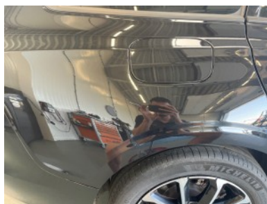
Rear right screen - Scratch