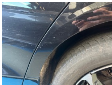
Rear left screen - Scratch