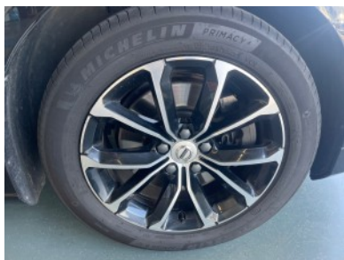
Front right rim - Scratch