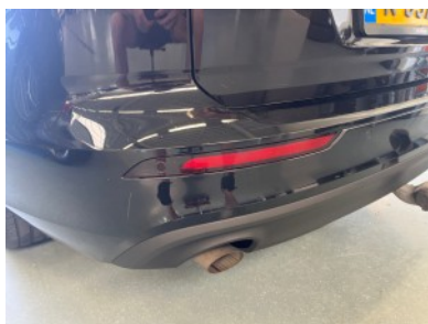
Rear bumper - Scratch