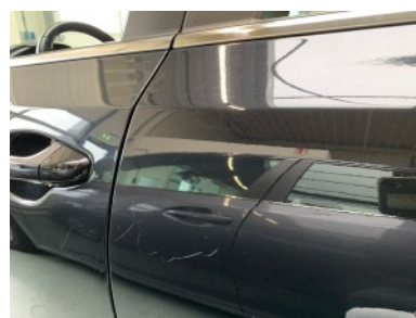
Rear left door - Scratch