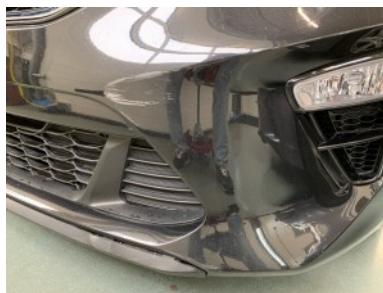
Front bumper - Scratch