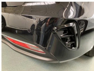
Rear bumper - Scratch