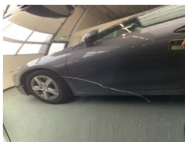
Front left door - Scratch