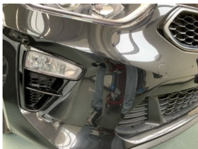
Front bumper - Scratch