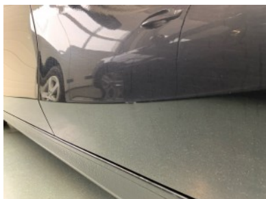
Rear left door - Restyle dent