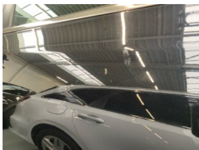
Rear right door - Rust formation