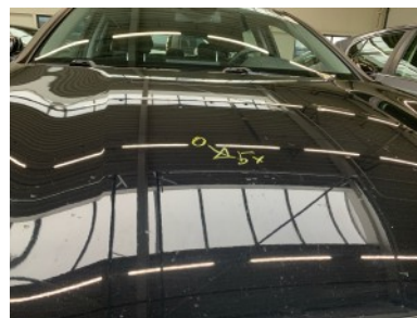
Bonnet - Restyle dent