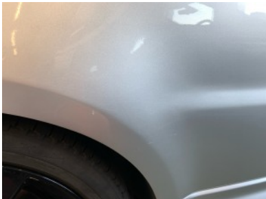
Rear right door - Scratch