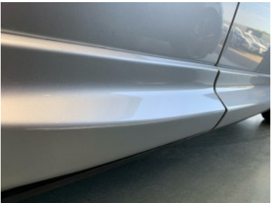
Rear right door - Scratch