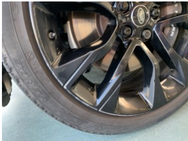
Front left rim - Scratch