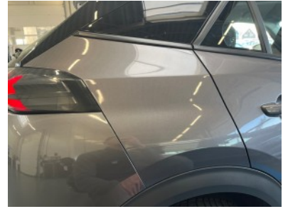
Rear right screen - Paint repair