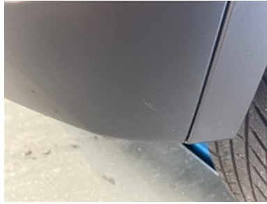
Rear bumper - Scratch