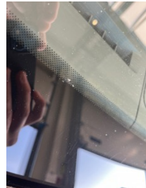
Windscreen - Stone chippings