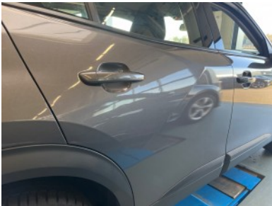
Rear right door - Paint repair