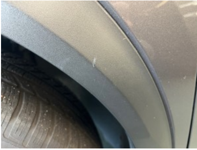
Front left screen - Scratch