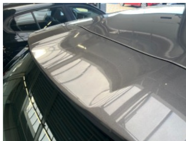
Tailgate/ lid - Paint repair