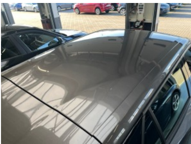
Roof - Paint repair