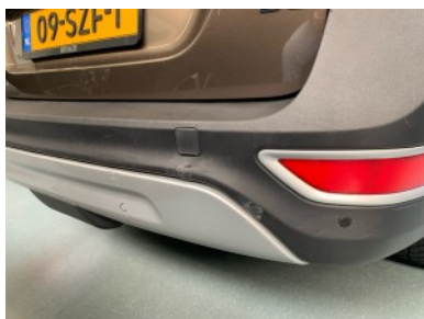
Rear bumper - Dent