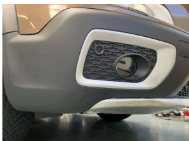
Front bumper - Scratch