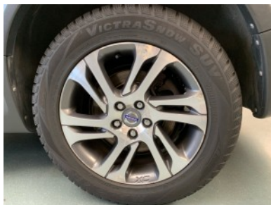
Rear left rim - Scratch