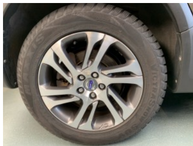
Rear right rim - Scratch