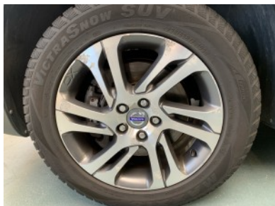
Front left rim - Scratch